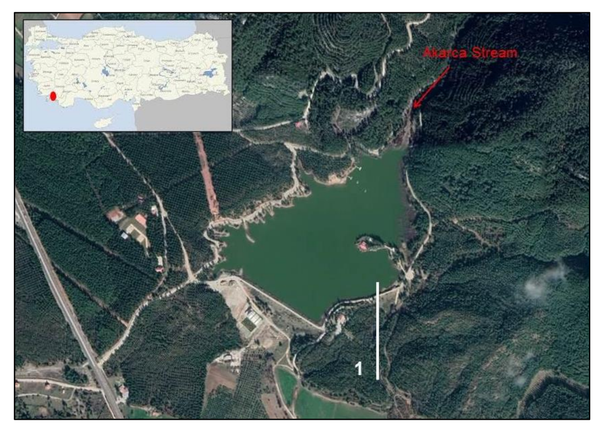
Şekil 1. Ula Pond, Mugla province (Sampling areas are shown by white line) (https://earth.google.com/).

Occurrence Of Ligula Sp. Plerocercoids İn Ladigesocypris İrideus (Ladiges, 1960) From South-Western Turkey: New Host And New Locality Records