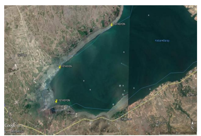
Figure 1. Keban Dam Lake Yurtbaşı Region sampling stations

Keban Dam Lake, which is the most important surface water source of the province along with the Hazar Lake, is located 45km north-west of Elazığ and 45km north-east of Malatya. It is the second largest dam lake in terms of surface area. Its area is 645 \text{km}^2 [4]. Monthly samples were taken between May 2011 and April 2012 in order to detect zooplankton fauna at Yurtbaşı locality of Keban Dam Lake. 3 stations (1<sup>st</sup> station 38°36'58.8''N 39°22'0.3''E, 2<sup>nd</sup> station 38°37'59.2''N 39°23'32.6''E, 3<sup>rd</sup> station 38°38'17.09''N 39°24'0.4.7''E) were chosen to represent the study area best for sampling (Figure 1).