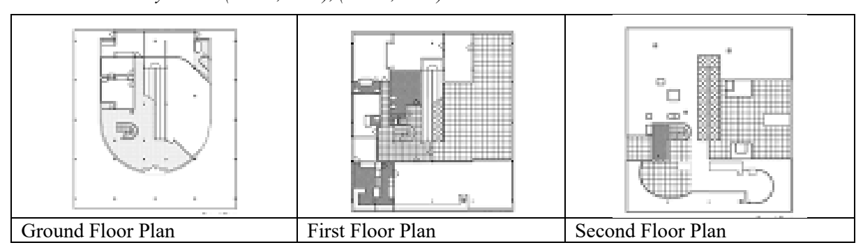
Table 2: Villa Savoye Plans (Url-4., 2021), (Url-5., 2021).

As evident in the floor plans of the building, half-open spaces are created on the ground floor by elevating the pilotis. Moving to the first floor