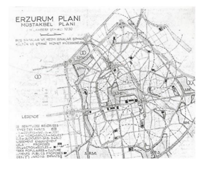
Figure 3: Plan of Lambert (Kulözü, 2016).

Detailed information about the Tekel Building, designed during Erzurum's radical modernity period and serving as the focus of this study, which has not been the subject of an academic study before, and its current use as the KUDAKA Building, will be presented in the following section under the material heading.