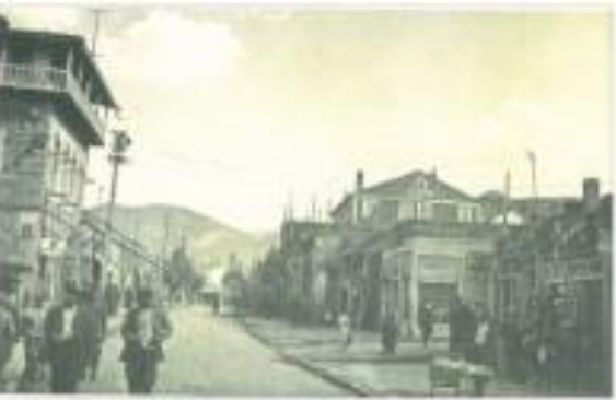
Figure 2: Before modernization: Taş Mağazalar District in Erzurum at the beginning of the 20th century (Kulözü, 2016).