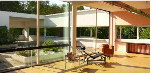
Figure 5: Villa Savoye (Url-6., 2021).