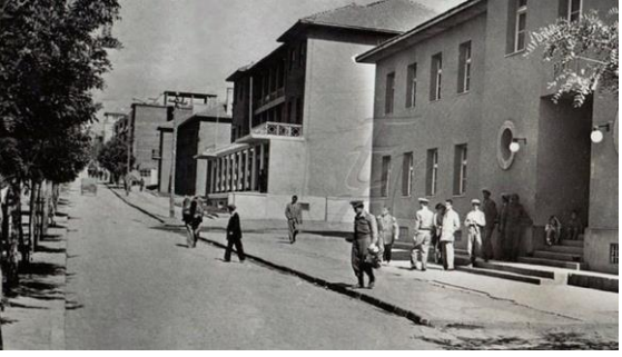
Figure 4 (Left) View from Cumhuriyet Meydanı to Cumhuriyet Caddesi in the 1950s (Tekel Building on the left, PTT Building on the right) (Url-2., 2021). (Right) The Old PTT Building and the Police Station (former Orduevi) next to it. (Url-3., 2021).