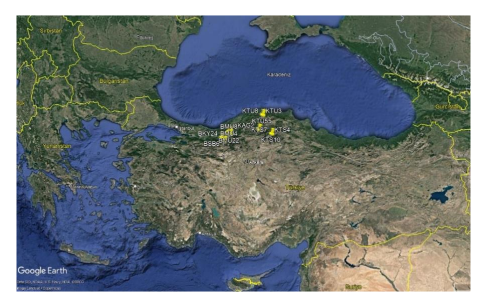
Figure 1. Locations of sampled natural C. colurna populations in Türkiye (see Table 1 for population numbers).