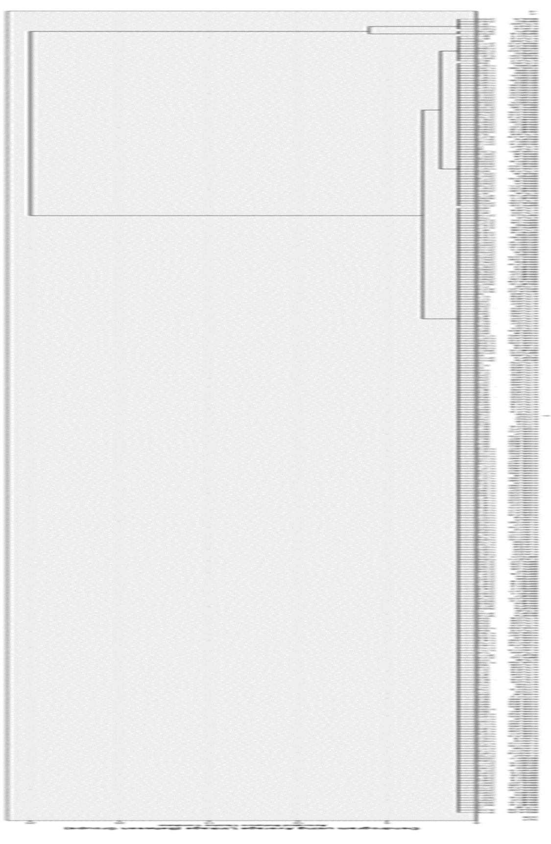
Figure 3. Cluster analysis based on the rootstock.