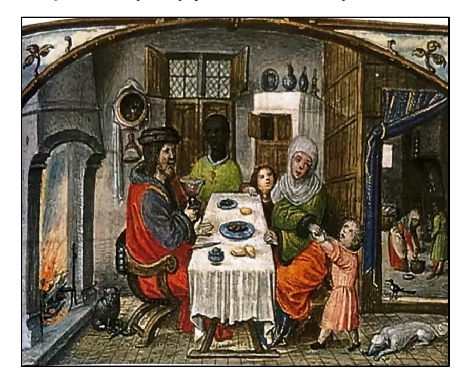
Figure 1: The migration graphic that is used in the 6th-grade textbook