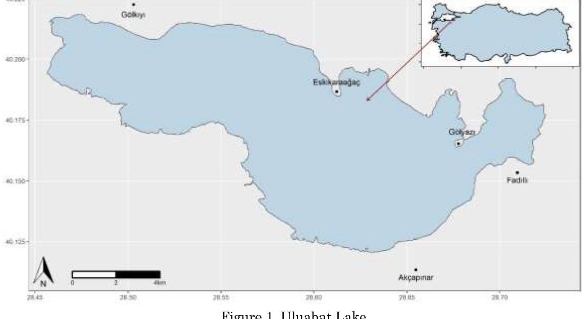
Figure 1. Uluabat Lake Şekil 1. Uluabat Gölü

the close seasons) between April 2015 and May 2016, and were administered to 375 amateur fishermen. Survived fishermen number and age information are given in Table 1. Used questionnaire forms were included in some question about social, economic and demographic status of angler besides applied fishing pressure on fish populations of lake.