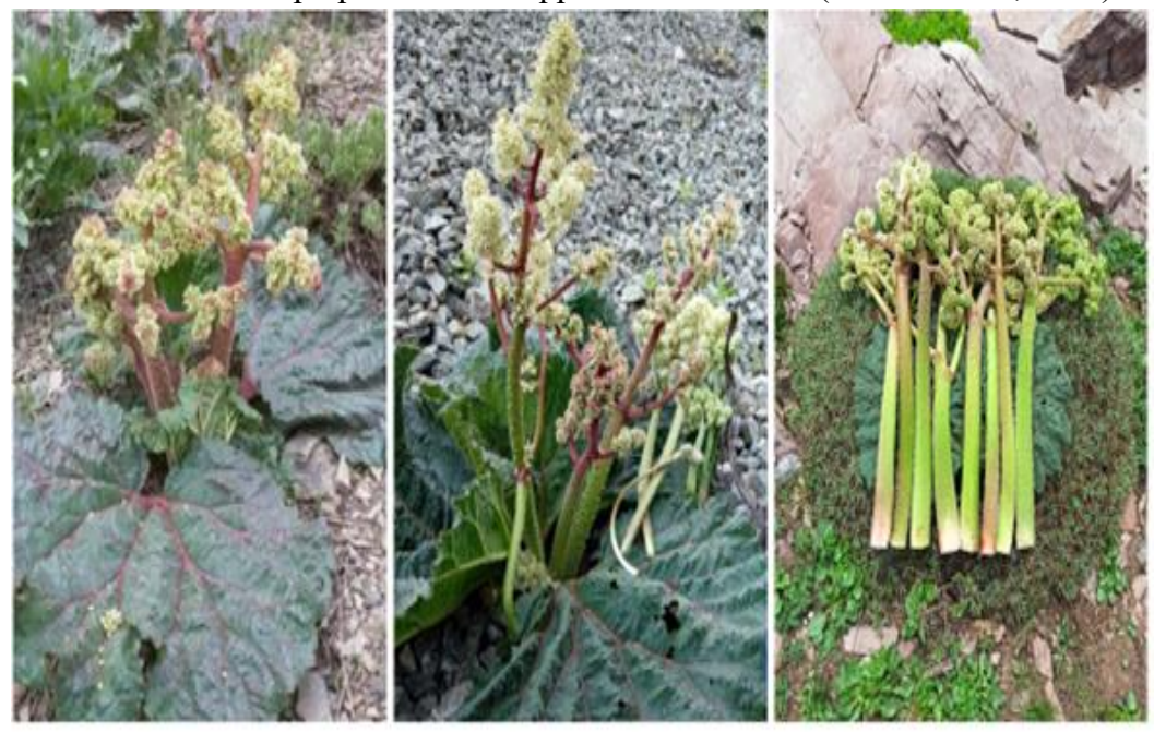
Figure 1. Turkey / Elazig / Aricak / Saman town images by R. ribes

Figure 1. 150 grams of R. ribes samples were dried in an oven at 60 °C for 24 hours. It was then ground in an IKA brand mill. 100 grams of ground plant samples were taken and 500 mL of Methanol Chloroform mixture (1:1 v/v) was added and kept in a desiccator for three days. The extract obtained after evaporation at 35 °C was prepared with 10 ppm distilled water (Tufekci et al., 2018).