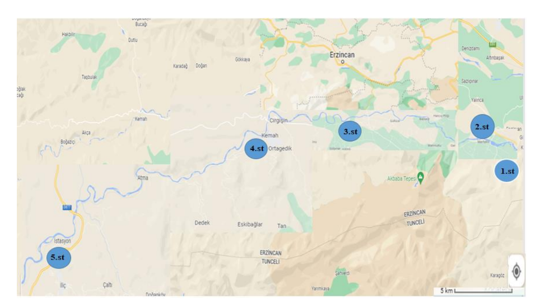
Figure 1. Location of the Karasu River and the sampling sites

As one of the main tributaries of the Euphrates River, the Karasu River flows from the Dumlu Mountains in the Erzurum Plain and is located in the eastern part of Turkey. It flows through the district of Aşkale and passes through the town of Mercan in the Karasu Valley in the province of Erzincan. It forms the Euphrates River joining the Murat River near the town of Keban. Its length to the Keban Dam Lake is 460 km [10]. This study contains Erzincan Provincial decomposition sections. The convenient stations and coordinates are given in Figure 1.