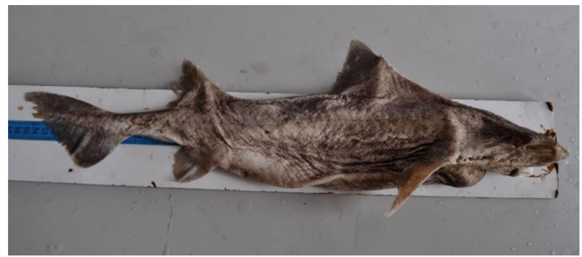
Figure 2. O. centrina caught from the Marmara Sea.