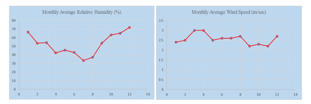
FIGURE 2. Monthly changes of meteorological parameters in Niğde province (2014)