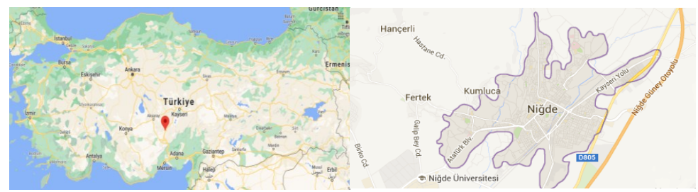
FIGURE 1. Location map of the studied area.

The continental climate is dominant in the province of Niğde, with hot and dry summers, cold and snowy winters. There is very little forest existence. It constitutes 1.7% of the provincial lands, and increases to 3 percent with the heathland. 50% of the provincial lands are cultivated-planted areas, from wheat fields, apple orchards and vineyards; 37% consists of meadows and pastures. The rest is made up of land that is not suitable for cultivation. Average annual rainfall is 349 mm with at least one of the wettest regions of Turkey. Most of this precipitation occurs during the winter months.