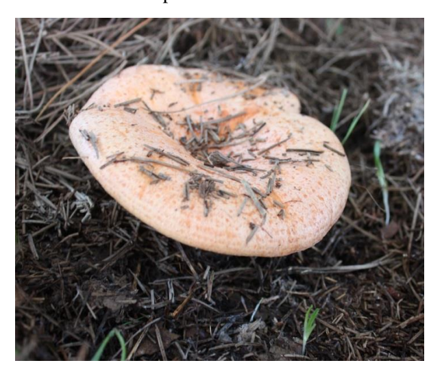
Figure 11. Lactarius deliciosus

(2016) reported that ethanol extracts of H. erinaceus fungus showed Helicobacter pylori inhibition<sup>33</sup>. Terfezia boudieri Chatin (Scop.) Pers. is a famous mushroom both in our country and in the world with its pleasant aroma and taste.