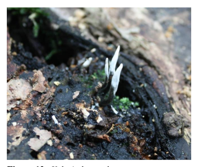
Figure 12. Xylaria hypoxylon

Vizzini, the alleged antioxidant properties may be somewhat beneficial against the antioxidant protection system of the human body against oxidative damage<sup>60</sup>. Canli et al. (2016) reported that Xylaria hypoxylon (L.) Grev. (Figure 12) has in-vitro antimicrobial activity<sup>61</sup>.