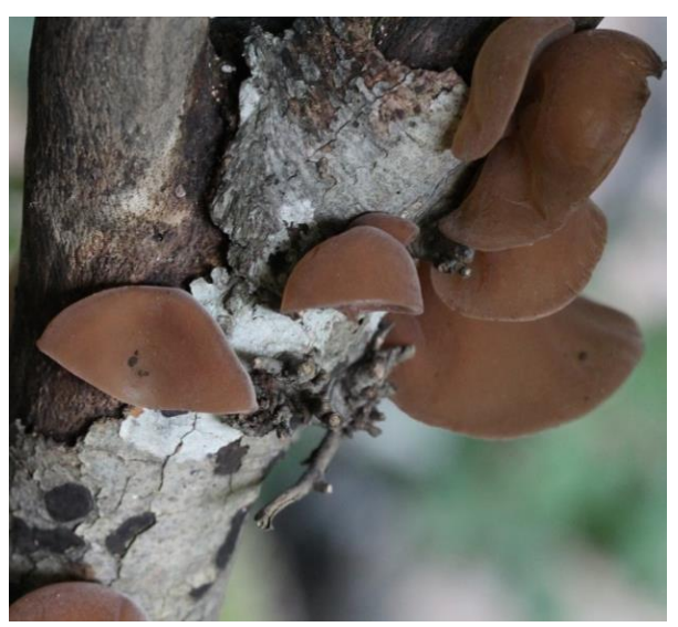
Figure 7. Auricularia auricula-judae

Fomitopsis officinalis (Vill.) Bondartsev & Singer is known to be used in some societies to control milk secretion at the time of weaning and Lactarius piperatus (L.) Pers.'s milk is used against viral warts9. Geastrum triplex Jungh.; it is caustic, detoxic, strengthens the throat and lungs and regulates body temperature and lowers fever <sup>38</sup>. It is also said to reduce respiratory inflammation. According to the literature, laryngitis is boiled together with licorice for sore throat and cough. It is used to stop bleeding and reduce swelling<sup>38</sup>. The veast used the spores of the Geastrum Pers. species to treat wounds<sup>39</sup>. There are sources in North America that Cherokee natives apply the powders of some Geastrum species to the umbilical cord after birth as hemostatic and antibiotic<sup>40</sup>. A mushroom used in the treatment of various cancers in the north-west of Russia and grown on birch is noted in Russian folklore. Being known as Chaga (I. obliquus), this fungus is well known in Russia with its anti-cancer properties<sup>41</sup>. Hericium species edible medicinal mushrooms in Basidiomycota class in Hericiaceae family types. In China and Japan, it is widely used as a medicine