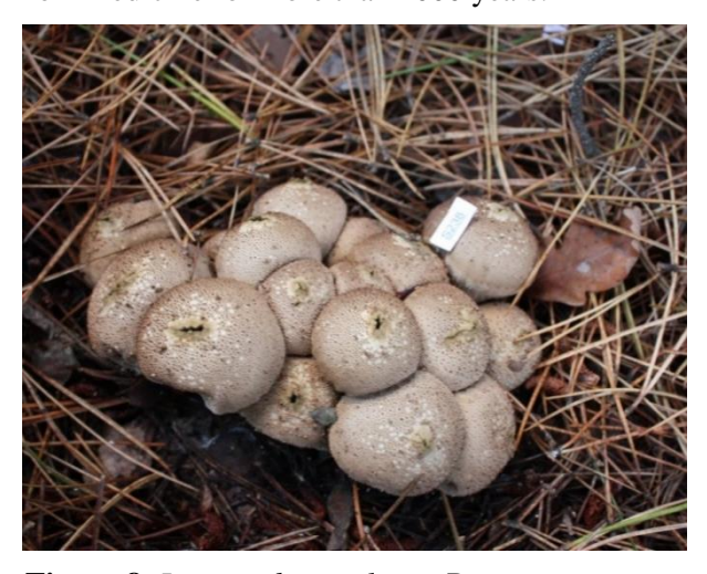
Figure 8. Lycoperdon perlatum Pers.

as well as a food source<sup>42,43</sup>. Being known as "Red Immortal Mushroom Lingzi or Reishi"; G. lucidum has been used in Chinese and Japanese folk medicine for more than 2000 years.