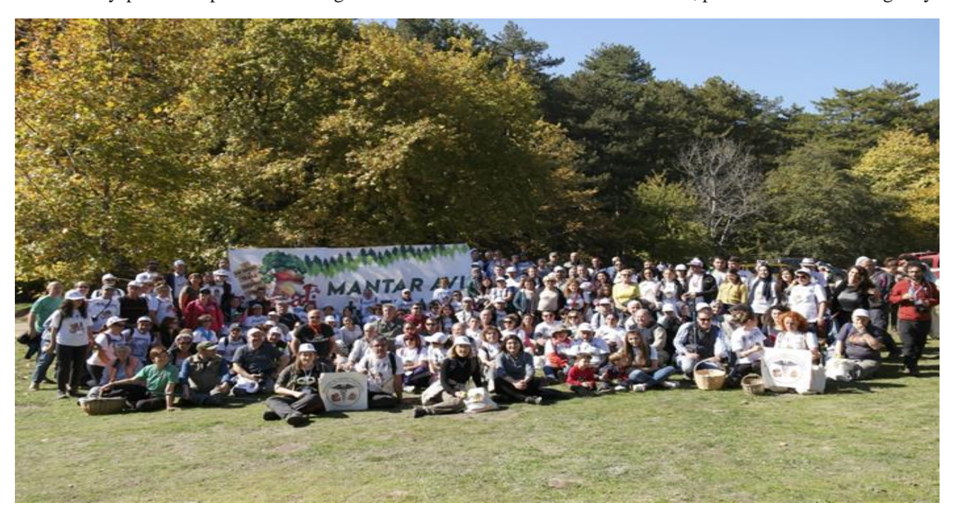
Figure 1. Metropolitan Municipality Wild Mushrooms Training Festival Ida Mountains Mushroom Hunt (2017)

food, the magic mushroom of the shamans, the healing source of the Far East, or a deadly poison responsible for the death of emperors, mushrooms is a passion for some people. Every year, these passions bring together thousands of people from all over the world at mushroom festivals (Figure 1)<sup>10</sup>. Mushrooms have long been a tasty food alternative for many societies around the world in the early ages, people discovered which mushrooms are edible, poisonous or halisunogic by