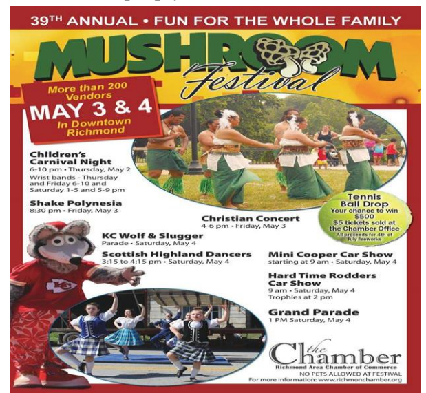
Figure 5. The Richmond Mushroom Festival (2019)

phlebotomy and balanced nutrition for the treatment of Epilepsy<sup>37</sup>.