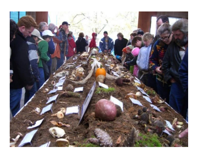
Figure 4. Mt. Pisgah Mushroom Festival, Eugene Oregon

It was considered a tonic, blood purifier and pain reliever and was widely used against cancer in the 1960s in Poland<sup>34</sup>. According to literature, Avicenna recommended truffles, wild boar meat,