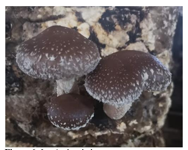
Figure 6. Lentinula edodes

The blood clotting effect of Auricularia auricula-judae (Bull.) Quél. (Figure 7), known as the "ear fungus" among the people, in some communities, the blood stopping effect of Lycoperdon Pers.(Figure 8) and some Polyporus P. Micheli ex Adans. species in the umbilical hemorrhage of newborn babies and nasal bleedings, in some societies, the weaning effect of Laricifomes officinalis (Vill.) Kotl. & Pouzar in controlling the milk secretion and the healing effect of Lactarius (L.) Pers. milk in viral wart treatments were all along known by the people.