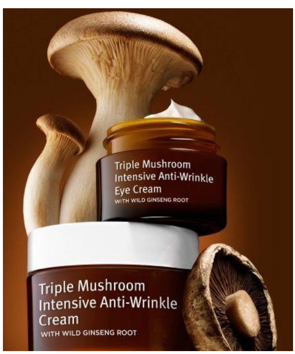
Figure 9. Cosmetic product containing mushrooms

Today, cosmetics with commercial value contain products of herbal origin. In addition to the herbal cosmetics, cosmetic products containing fungi include anti-aging, antioxidants, skin care products (Figure 9-10)<sup>47,48</sup> such as skin brightening and hair products<sup>49</sup>.