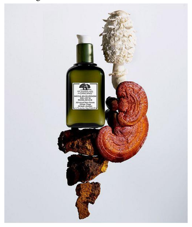
Figure 10. Cosmetic product containing mushrooms

discovery and subsequent research of hallucinogenic mushrooms<sup>34</sup>.