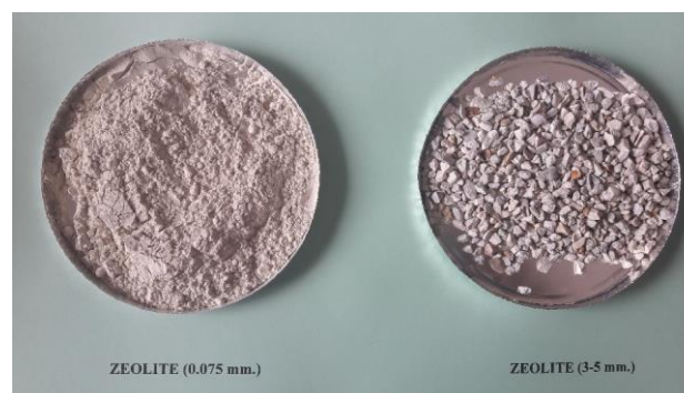
Figure 1. Experimental materials

Ammonium chloride stock solution (1000 mg/l) was prepared by dissolving \text{NH}_4\text{Cl} in deionized water. Solutions in using concentration was obtained was prepared by adding appropriate amounts of \text{NH}_4\text{Cl} stock solution of deionized water to obtain an ion range of concentration varying from 11.7 mg/l (Saltalı et al. 2007). Experimental groups were prepared by adding 2 liter of tap water in this research and trial groups with 3 repetitions were created for three different adsorbent dosages (5, 10, 15 g/l) and two particle sizes (0.075, 3-5 mm) (Saltalı et al. 2007; Mazeikiene et al. 2008; Öz et al. 2015; Aydın Temel and Kuleyin 2016) (Figure 1).