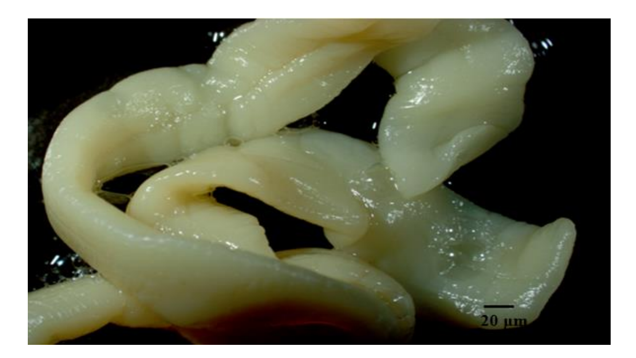
Figure 3. Plerocercoid of Ligula intestinalis (Scale: 100 µm-0,1mm)

N. rutili is an acanthocephalan worm. Their body is small and cylindrical. Their proboscis is short and there are 6 hook lines on the proboscis with 3 hooks on each. Their anterior hook is more elongated [16]. Parasites were found in the small intestines of fish. Hemorrhage was observed in areas where the parasites were widespread.