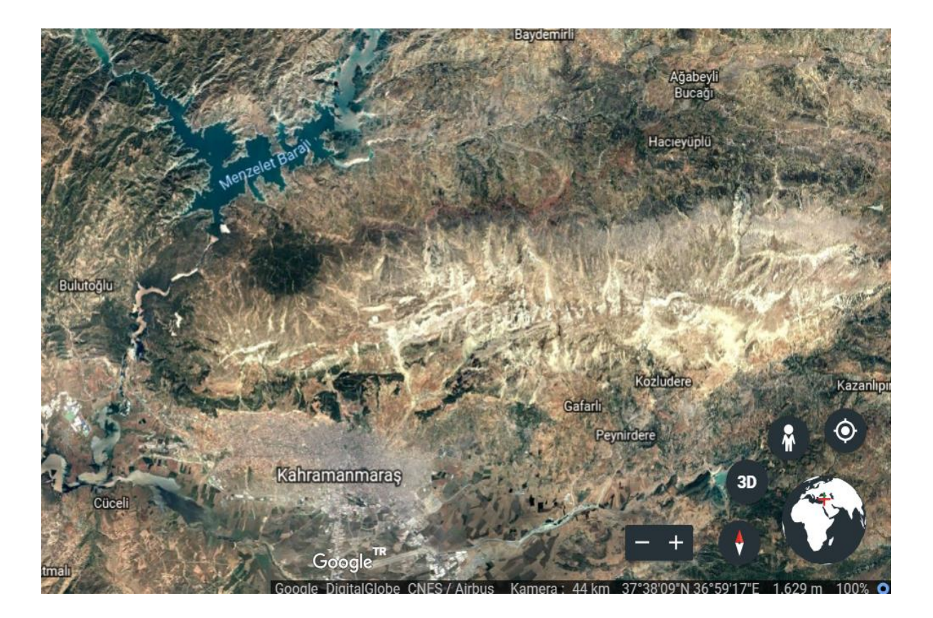
Figure 1. Locations of sampling sites in Menzelet Dam Lake