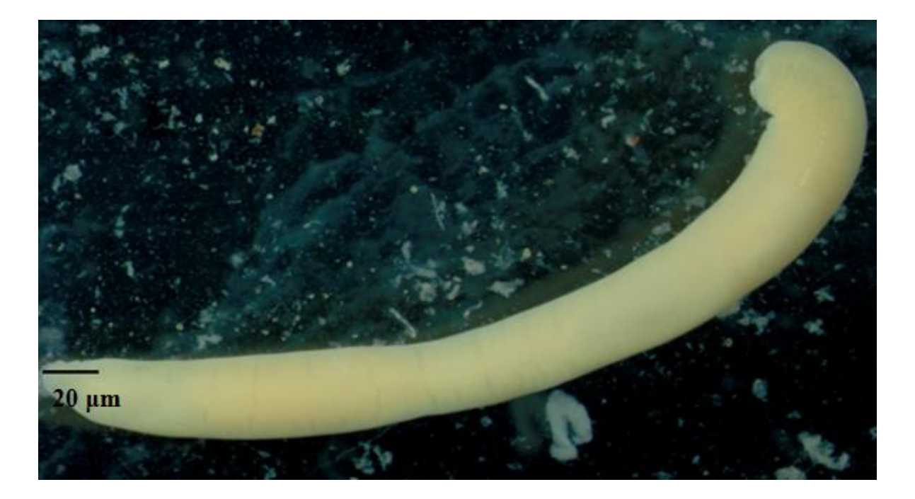
Figure 2. Neoechinorhynchus rutili (Scale: 100 µm-0,1mm)

N. rutili is an acanthocephalan worm. Their body is small and cylindrical. Their proboscis is short and there are 6 hook lines on the proboscis with 3 hooks on each. Their anterior hook is more elongated [16]. Parasites were found in the small intestines of fish. Hemorrhage was observed in areas where the parasites were widespread.