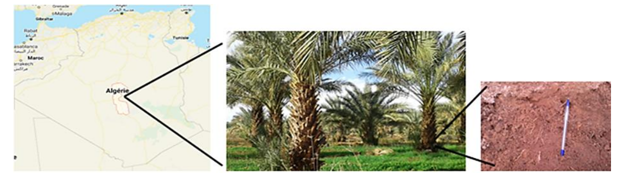
Figure 1- Geographic location of the palm grove in the In Salah region, Algeria [*rhizosphere soil]

Soil samples were randomly collected from three palm groves located in an arid area of Algeria (In Salah) (27° 11′ 55.69″ North, 2° 26′ 45.29″ East) during December 2020 (Figure 1). The sampling technique involved inserting a sterile spatula into the soil to a depth of 15 cm glued to the roots. The sample was placed in a sterile container and transported to the laboratory in an ice box set to 4 °C. The soil texture and physicochemical analysis (Table 1) were performed as described previously (Mathieu & Pieltain 1998; Mathieu & Pieltain 2003). Soil classification (World Reference Base: WRB) was based on the Group of Arid Hapylic Solonchaks (FAO WRB 2006).