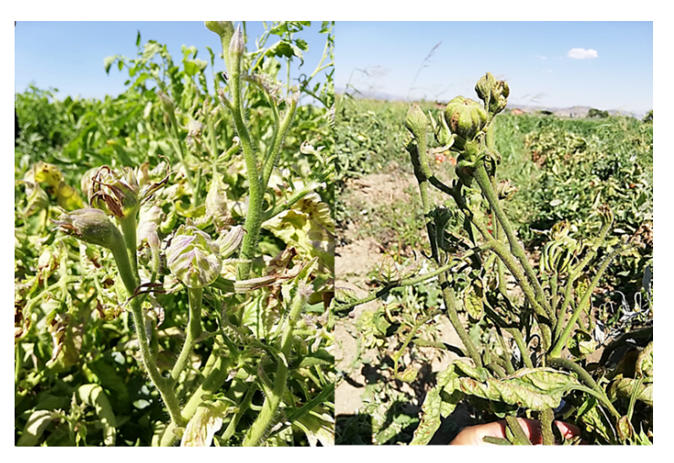
Figure 1. Various types of symptoms triggered by stolbur infection on tomato plants.

Phytoplasmas interfere with the host's hormone regulation, resulting in remarkable symptoms such as witches' broom, yellowing, reddening and purpling, phyllody, dieback, upward rolling, infertility, woody, and tasteless fruit formation, and stunting (Duduk and Bertaccini, 2011). In our study, Stolbur-diseased tomato plants exhibited striking symptom development such as elongated calyx, infertility and flower deformities, and scrub (Fig 1), which are consistent with those previously reported by many researchers (Pracros et al., 2006; Azza and Eman, 2016; Sakalieva, 2020). The occurrence of stolbur phytoplasma of tomato in Turkey was first known in 1953 and subsequently from potatoes in 1965 (Tanrıkut, 1953, Sahtiyancı, 1966). Moreover, the current study revealed the presence of ' Ca . P. solani' in tomato plants in Van province of Turkey by molecular analysis.