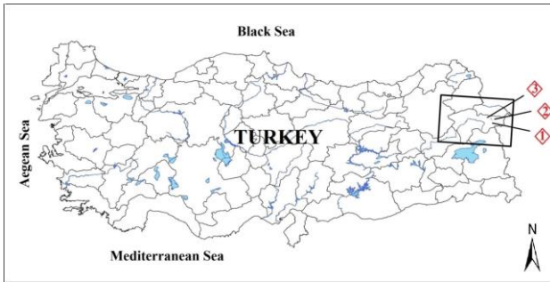
Figure 1. Map of the study area. 1. Doğubeyazıt-Sarısu (39°33'44" N 44°03'49" E; alt. 1704 m asl.) 2. Doğubeyazıt marshes (Saz lake) (39°41'14" N 44°04'15" E; alt. 1549 m asl.) 3. Doğubeyazıt-Karaca village (39°35'41" N 44°03'14" E; alt. 1567 m asl.)

The samples were collected in 2010 from three localities located in Ağrı Doğubeyazıt reeds (Figure 1). Collected samples were stored in plastic containers and fixed in 70% ethanol. Measuring and photographing were made by stereo microscope with digital camera system. Doğubeyazıt reeds on bird migration routes was extended to the Turkish-Iranian border on 28,000 km 2 area in the past. Today, this area has declined steadily by the extension of Sarısu riverbed (Yarar and Magnin 1997; Adızel et al. 2002).