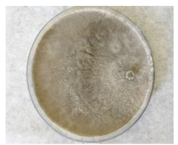
Figure 1. Colony of isolate SS on PDA

Three representative isolates from different geographical locations (Gazipaşa, Serik and Kumluca) were used for further comprehensive diagnosis. Fungal colonies of the three isolates on PDA had similar morphological traits. Initially, they were white but in time turned to gray with slightly fluffy aerial mycelium on PDA (Figure 1).