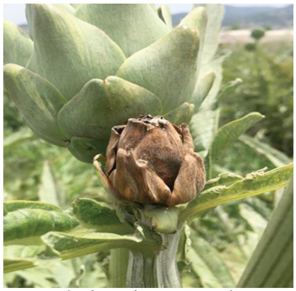
Figure 5. Early infection of Botrytis cinerea inducing rot on immature head of globe artichoke (Serik, Antalya)

Comparing surveyed areas in the both years, in 2016, surveyed area was 16.4% of the total artichoke growing areas in the region, while it was 22.3% in 2017. However,