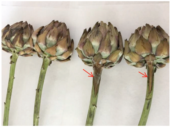
Figure 3. Pathogenicity test, no symptoms on the left two heads (control), lesion and rots on upper stems next to the heads on the right (with red arrows)

To fulfill Koch's postulates, eight healthy globe artichoke heads including upper stem parts were used for each isolate. Mycelial plugs, 5 mm in diameter, from one-weekold colonies were mount to the points of junction between upper stems and heads. Later, these parts were covered with parafilm and kept at 25 °C. Controls had only sterile agar plugs. Seven days later, necrotic and rotting areas appeared on the inoculated parts and then gray spore masses emerged. Length of the lesions on the stems ranged from 3.5 to 6.7 cm. No necrotic areas were seen on the controls (Figure 3). The fungus was reisolated from the necrotic plant tissues on the treatments.