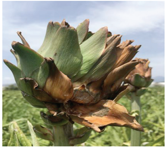
Figure 4. Beginning of Botrytis cinerea infection on the head of the globe artichoke (Gazipaşa, Antalya)

Conspicuous reddish-brown discoloration and rot symptoms and gray spore masses were usually observed on heads and rarely on upper stems next to the heads of plants. These symptoms were detected in the fields of Muratpaşa, Kepez, Aksu, Serik, Gazipaşa and Kumluca locations in the Western Mediterranean Region of Turkey. Rots on the heads were detected at any development stage of head formation. For example, mature head rot (Figure 4) and immature head rot (Figure 5) were established, which showed destructiveness of the fungus in the globe artichoke fields.